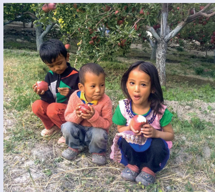
Small children enjoying apples in a farmer's orchard!

Our Trustees thought that if we could provide each household with