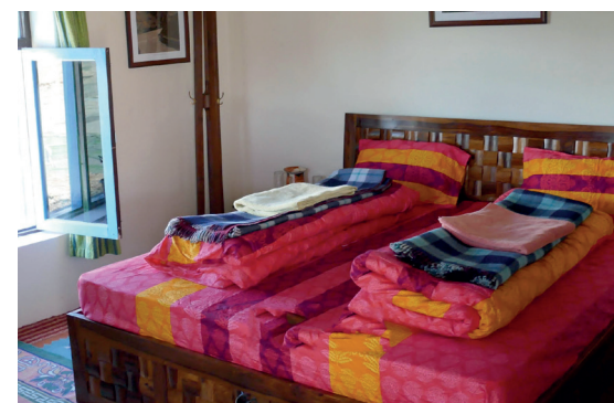
A home stay bedroom