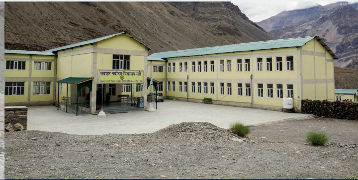
A happy school girl and the newly built boarding school

students their aim in life, they spoke of their hopes and dreams. They all have high expectations - some may leave at 10th class (GCSE) level and some wish to continue to 12th class (A level) and then go to college.