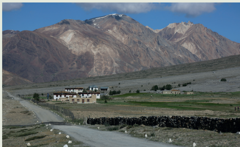
The Rhotang Pass - leaving the Kulu valley

Travel in Spiti is changing as the government has set in place some new rules. Because of Spiti's eastern boundary areas borders with China/Tibet, foreigners now have to acquire permits to travel to Kaza from Manali, then further permits are needed to travel south beyond Kaza towards Tabu and the places in between. These can be obtained at a government office in Sikkim.