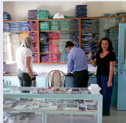
The Craft Shop offers locally made items