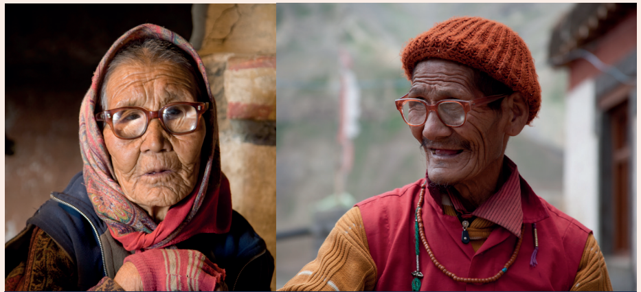
We aim to offer operations to patients diagnosed with cataracts. These would be undertaken at the Community Centre by surgeons visiting Kaza from the Rotary Eye Hospital in Palampur at least twice a year

A refraction examination is carried out to test pupil function and there are many things to be considered at the time: ocular mobility and visual field among many