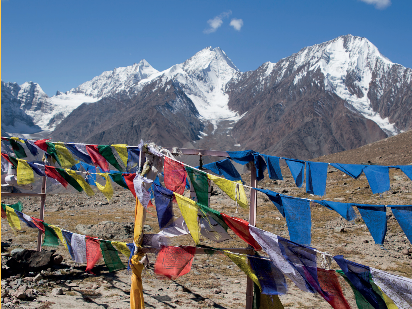
The Kunzum La Pass, entrance to the Spiti valley