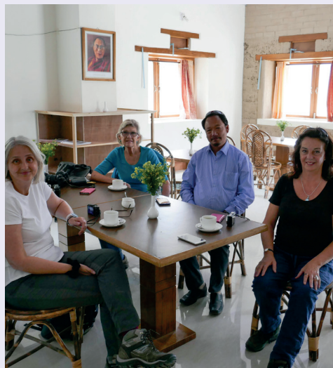
The Meeting room

The Craft Centre is up and running. There is a fantastic selection of Spiti socks and shawls made locally and handicrafts plus, of course, plenty of postcards.