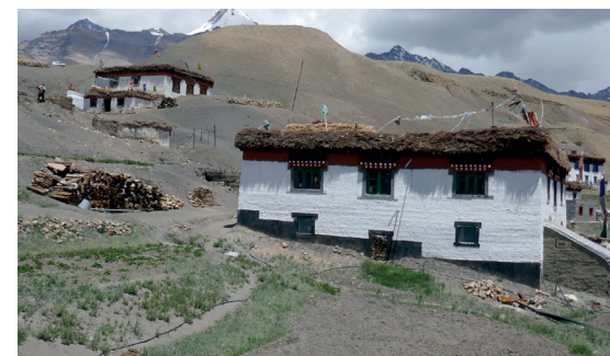
A typical village house for Home Stay visitors

The Spiti Valley has opened up more to visitors from India and afar so there are more opportunities for home owners to offer Home Stay. This has been a great success. This summer we were privileged to stay with families in their houses which enabled us to enjoy a more personal experience of real Spiti life.