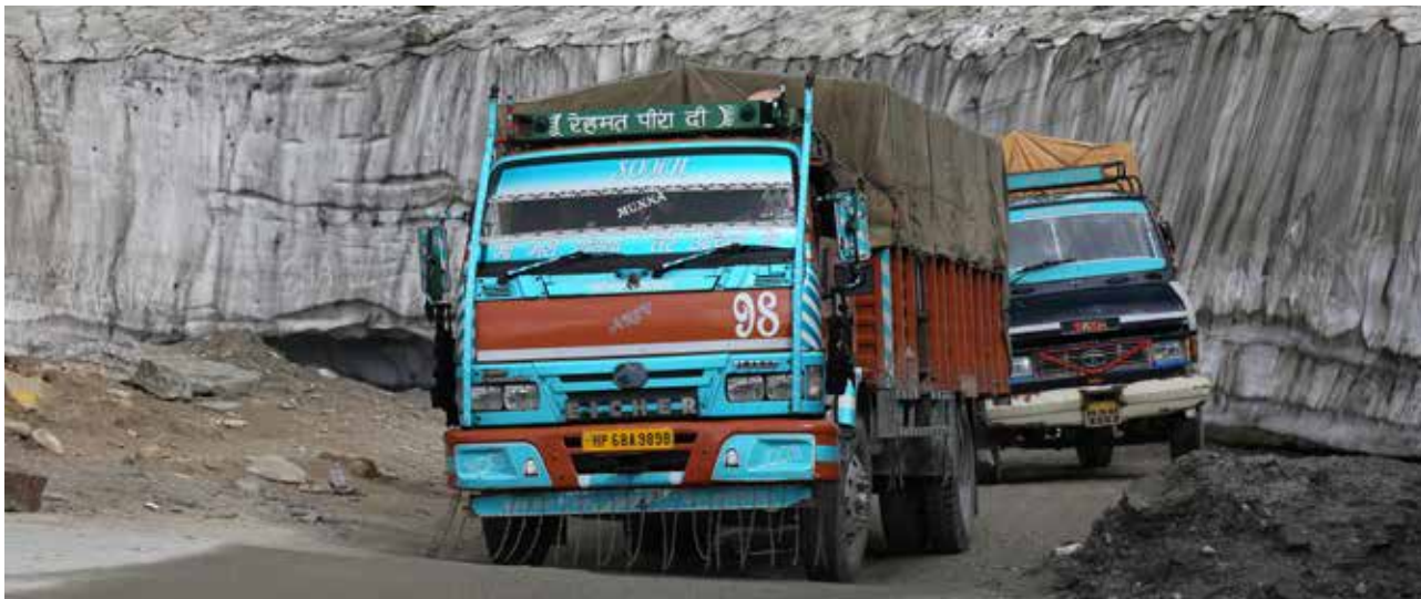
Courageous lorry drivers navigating the dangerous mountain roads in the valley bringing the necessary supplies to the Spiti people.

Travelling in Spiti is not always easy, the roads are unpredictable and every journey is different. The drivers always say a prayer that they will have a safe journey.