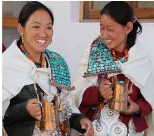
The two young women from Spiti chosen to train on a six week course at The Hyderabad Eye Clinic.

The International Eye Foundation based in Washington DC USA has established and supported International Eye Care, first in South India during the 1990s and now throughout India. The inhabitants of the Western Himalaya are fortunate to be considered for a tertiary Eye Care Centre in Himachel Pradesh North India, to cover the needs of the outlying areas of the region, Lahoul, Spiti and Kinnour. This will give over 60,000 patients annual treatment not currently available.