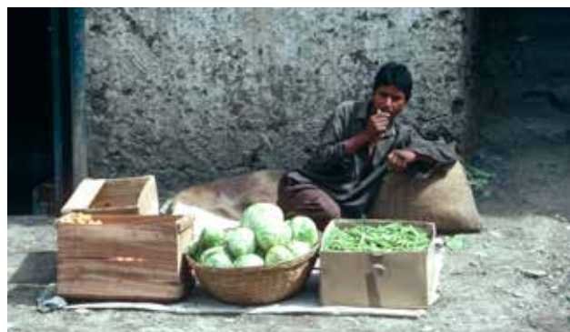
Above shows the extent of the fresh vegetable market in 1993. Below, twenty years later, with the construction of roads and trucks bringing supplies, the choice is much better.

much encouragement to the driver as I could muster as we set off. We rocked and rolled across but, thanks to my driver's fantastic courage and skill, we reached the other side safely. Once we were all across, all the drivers thanked each other and shook hands. The camaraderie among the drivers working together on these dangerous roads and seeing the way they cared for each other, left me feeling emotionally overwhelmed.