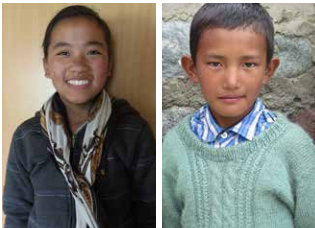
Two of the children who are currently benefiting from the sponsorship scheme.