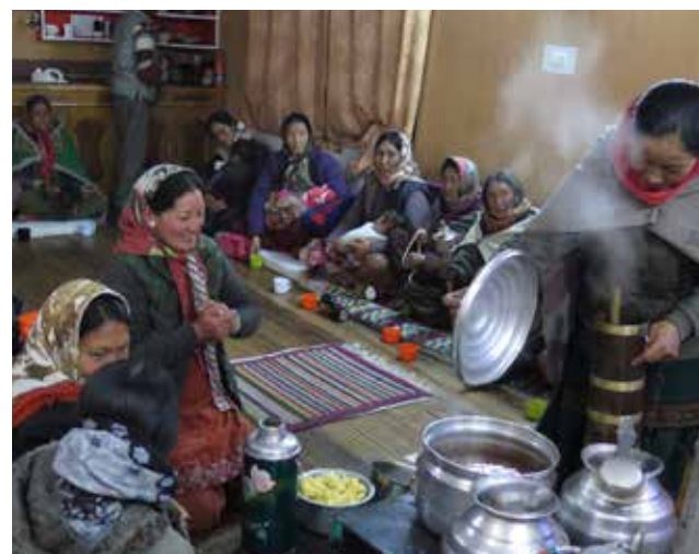
Village celebrations, meetings and cultural events during the winter months can now take place in the new facilities of the Community Centre.

Meanwhile work continues on the facilities inside the building. Furniture has been made by local craftsmen, the kitchen and bathroom facilities have been installed and we have incorporated eight bedrooms in the building for home-stays and summer visitors. Work is currently under way on the craft centre where we will sell traditional and locally made shawls, socks and