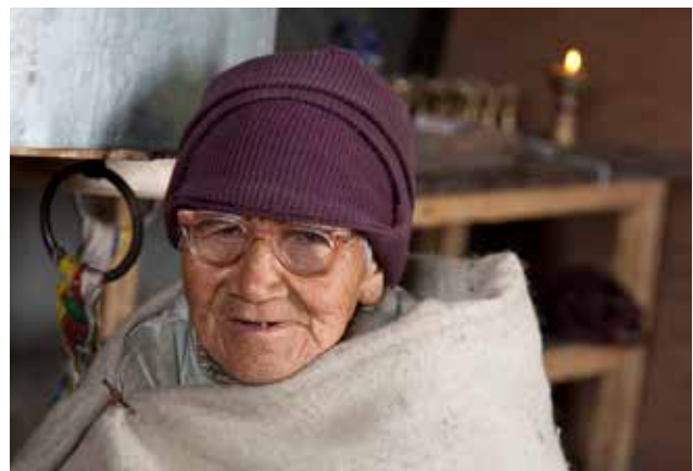
The Eye Centre will provide care for the needy and the ability to purchase affordable glasses.