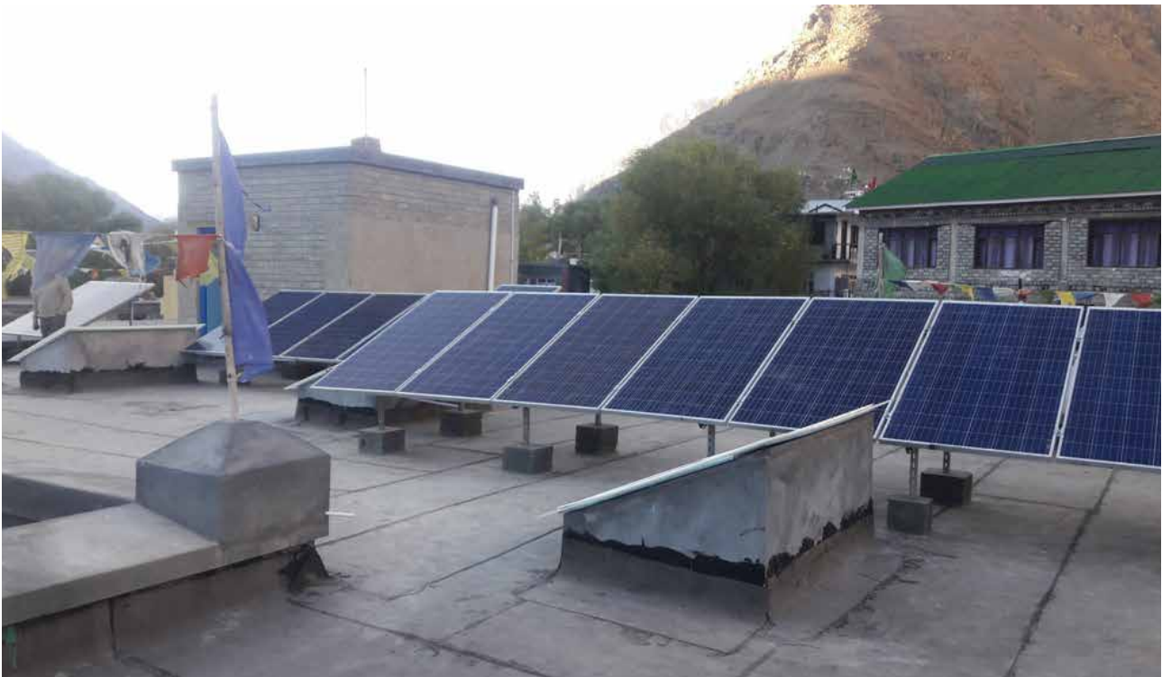
The recently installed solar panels on the roof of the Community Centre.

A day of celebration – was the day the solar panel installation was completed on the roof of the Community Centre in Kaza, just in time for the winter!