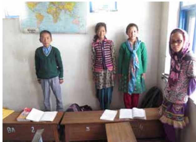
Children receiving a sound and basic education in the new school in Spiti.

By offering sponsorship to a child from a poor family, you give them an opportunity beyond their wildest dreams. For just £200 a year for 10 years, you can give them a chance in life to get a qualification and earn a living that will help to support their parents and family. So, thank you for your support and please tell your friends there are lots of lovely children waiting to be given a chance in life.